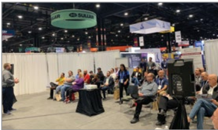
Sponsor the New Technology EXPO Classrooms for Compressed Air, Cooling Systems and the Leak Detection Shooting Range!

Join Facility/Utility Engineers, Facility Maintenance, Sustainability/Energy Directors, Engineering Firms, Compressed Air Distributors and Chiller/Cooling Tower Rep Firms to share “Best Practices” with On-Site Utilities (Compressed Air, Pneumatics, Nitrogen Generation, Motors, Pumps, Vacuum, Blowers, Chillers and Cooling Towers) . They will convene to share industry “Best Practices” for positive impacts on Sustainability, Safety and Reliability manufacturing metrics.