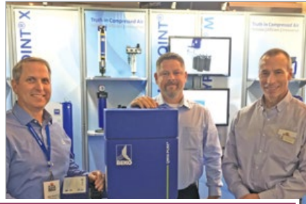
Exhibit your technologies at the EXPO and meet new distributors and direct factory accounts. The EXPO Hall also features the New Technology EXPO Classroom and the Daily EXPO $1,000 Energy Treasure Hunt Raffle!