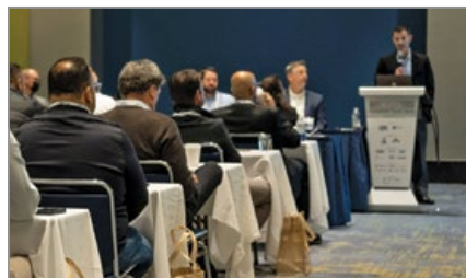
Education & Certification includes two conference tracks, CAGI CCASS Exam, CAC Level 1 Training, CTI Seminar and Hard Hat Compressed Air Maintenance Workshop

“I’m very pleased with the event. The level of innovation and expertise at the show made it very worthwhile. I also really enjoyed meeting new vendors.”