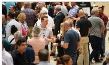
Sponsor the very popular annual Best Practices Networking Event!