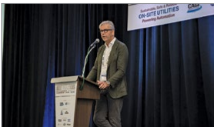
2024 Keynote Speakers represented CAGI, CTI, Ardagh Glass Packaging, Gates, Jacobs, Black & Veatch, E4E Solutions, Dove Energy Services, Universal Creative